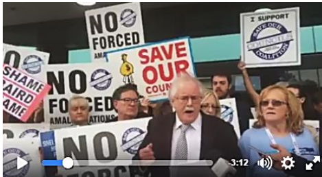
Mayor of Shellharbour

Videos were taken outside the Conference of the protest rally and two of the speakers. A video inside the Conference shows Baird promising to meet with councils.