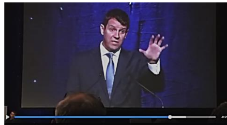
Baird to meet councils