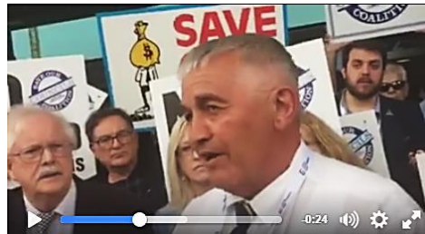
Mayor of Cabonne