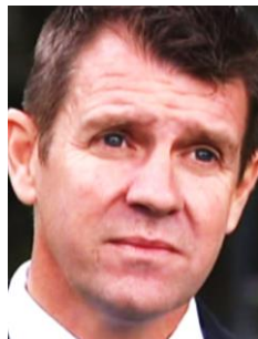
Premier Mike Baird